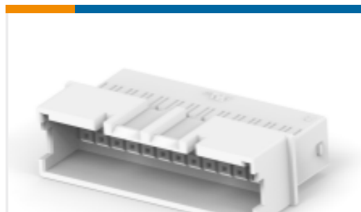
TE Part # 2-2324582-6 HSG,REC,FREE-HANGING,DUALROW, EP2.5